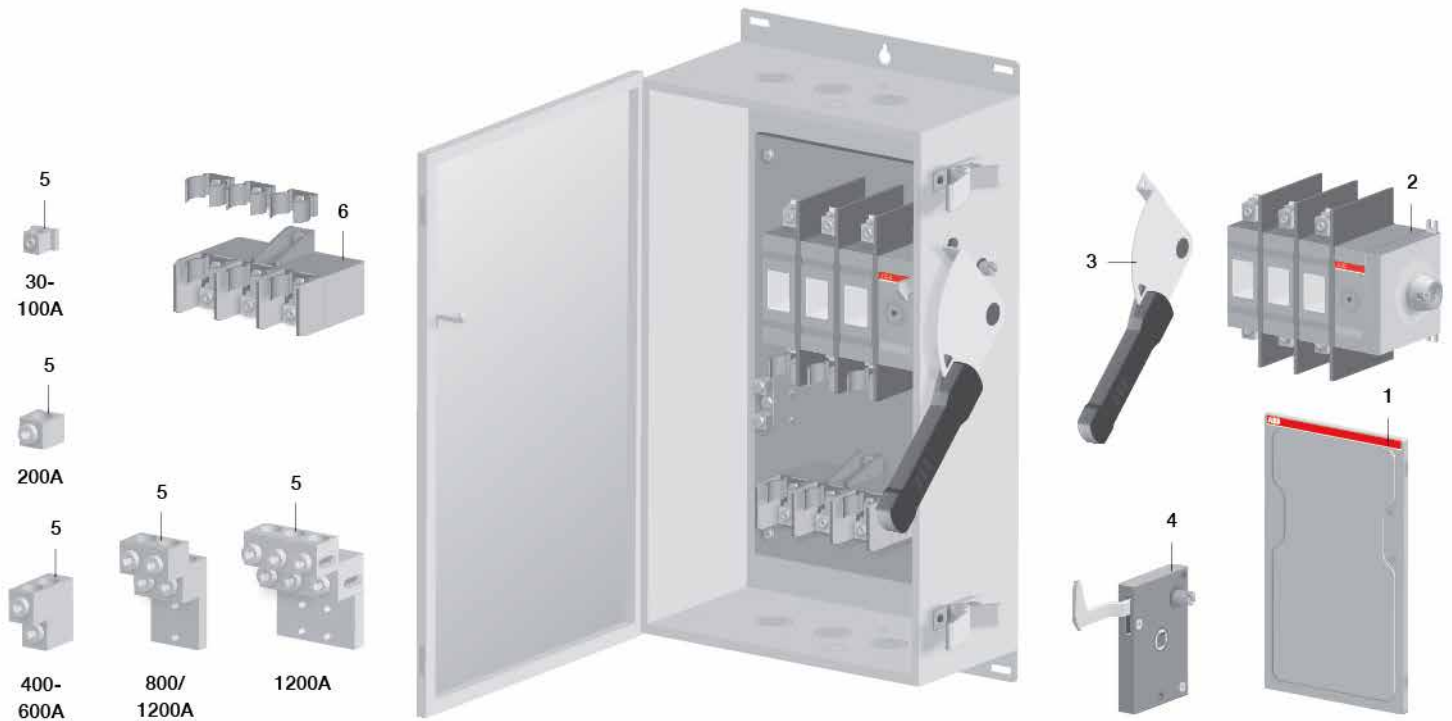
1 Door assembly | 2 Switch-disconnect | 3 Handle kit | 4 Door interlock mechanism | 5 Line / load side lug assembly (for switch size) | 6 Fuse bases