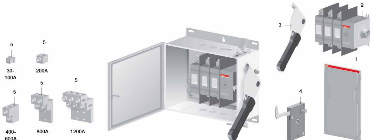
1 Door assembly | 2 Switch-disconnect | 3 Handle kit | 4 Door interlock mechanism | 5 Line / load side lug assembly (for switch size)